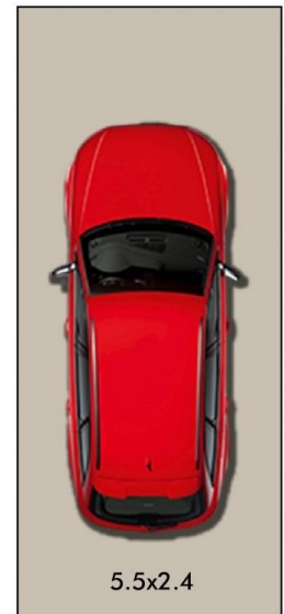
SECURE UNDERCOVER CARSPACE