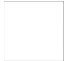
STORE ROOM (NOT ACTUAL LOCATION)