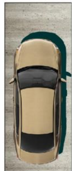
UNDERCOVER CAR SPACE 2.5 X 6.5

FLOOR PLAN BY BORTEX PTY LTD PH: 0414 922 679