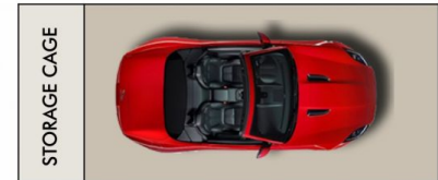
SECURE UNDERCOVER CARSPACES